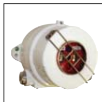
UV and UV/IR Electro-Optical Digital Fire and Flame Detectors